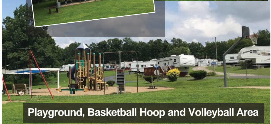
Playground, Basketball Hoop and Volleyball Area